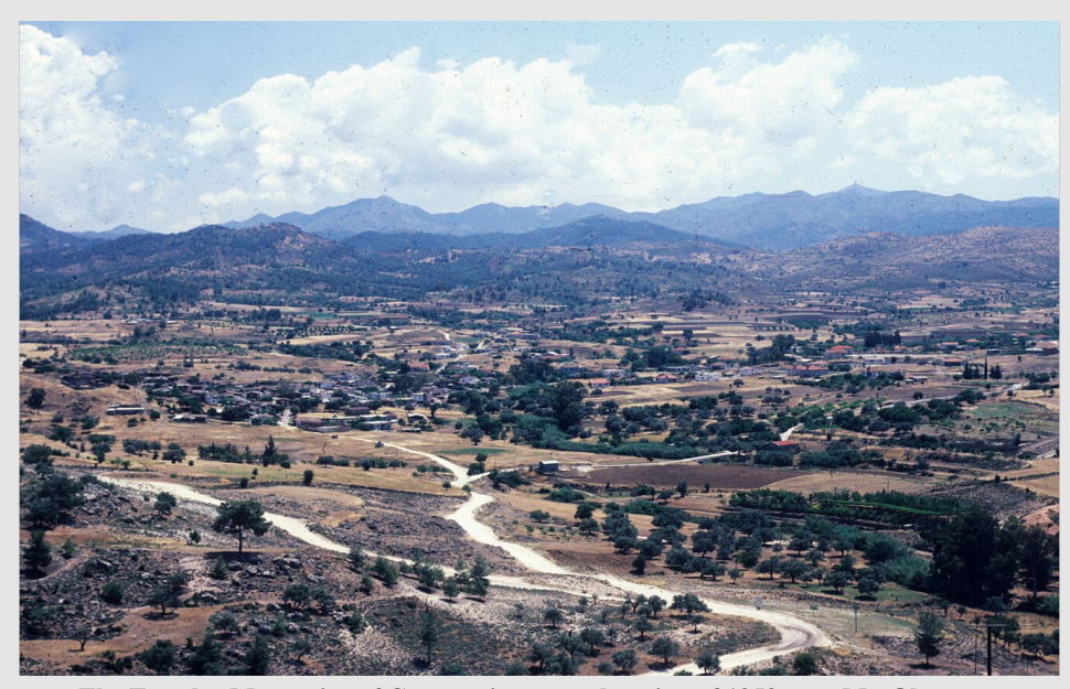
The Troodos Mountains of Cyprus rise to an elevation of 1952 m at Mt. Olympus, the center of the Troodos Ophiolite

Cyprus is served by airlines from most European countries, which mostly fly into Larnaca Airport. Public transportation is somewhat limited so arrangements will be made to meet participants upon arrival.